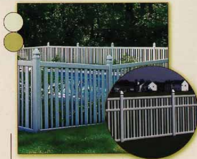
MONARCH/MONARCH WITH MIDRAIL Heights: 3', 4', 5' & 6' (5' & 6' include midrail) Colors: White & Tan Picket Style: 7/8" x 1-1/2", 7/8" x 3"