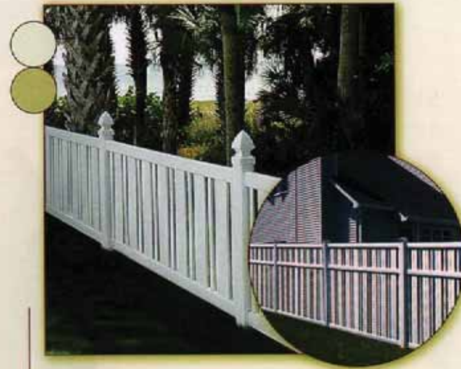
COUNTESS/COUNTESS WITH MIDRAIL Heights: 3', 4', 5' & 6' (5' & 6' include midrail) Colors: White & Tan Picket Style: 7/8" x 1-1/2", 7/8" x 3"