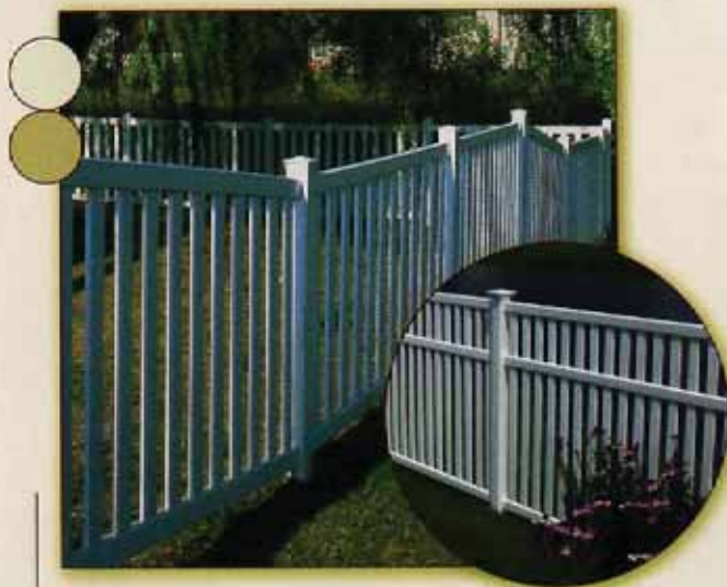
BARON/BARON WITH MIDRAIL Heights: 3', 4', 5' & 6' (5' & 6' include midrail) Colors: White & Tan Picket Style: 7/8" x 3"

Rectable pickets maintain a clean, upright appearance on sloping terrain. Bottom rail reinforced with steel for added strength and durability.